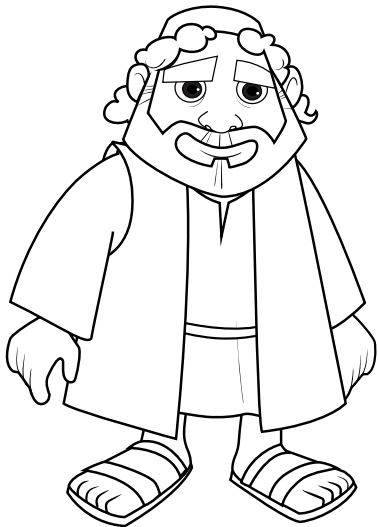
Jesus loves everyone. Zacchaeus • Luke 19:1-10